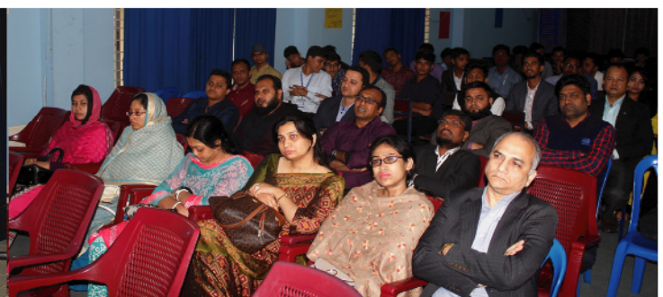
Freshers Reception BBA 2018