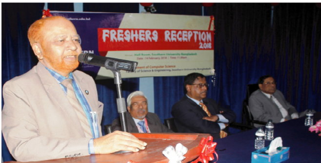
Freshers Reception CSIT-18