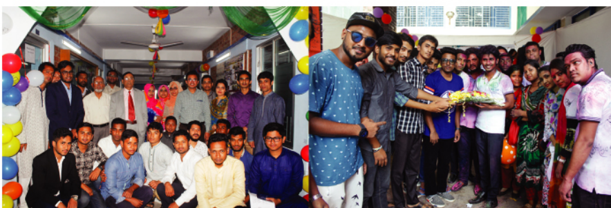
Freshers Reception EEE & ECE Farewell law 26 batch