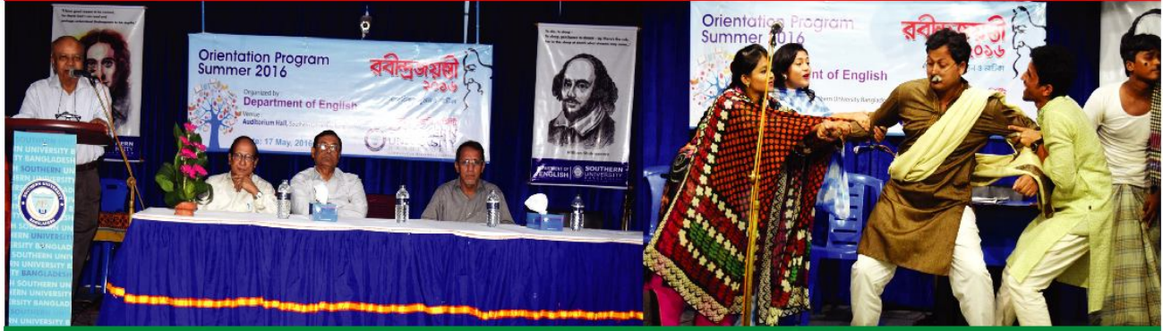
Department of English organized mini drama on Rabindra nath