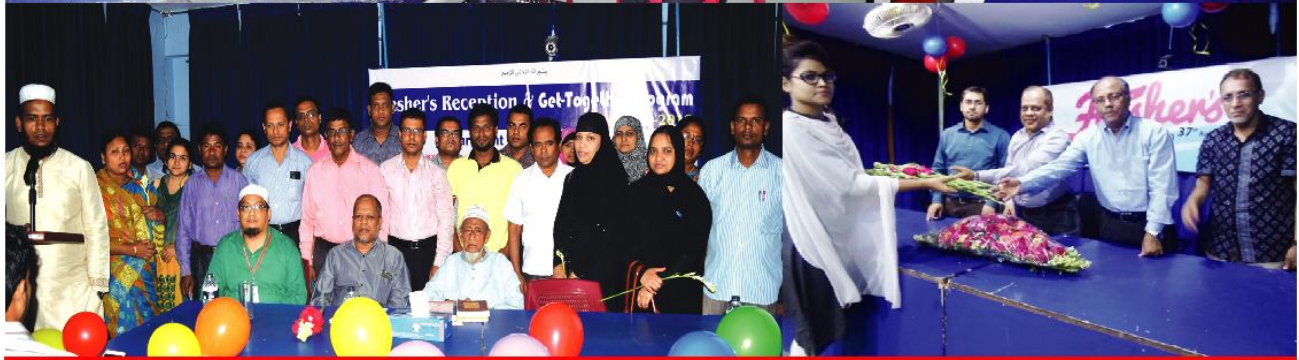
Various Departments Fresher's Reception & Orientation Summer 2016