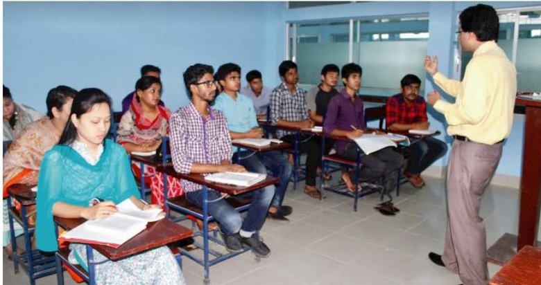
Class at Permanent Campus