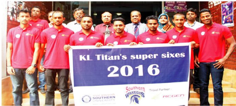
Southern Cricket team Southern Warriors