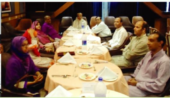
Department of Computer Sc.