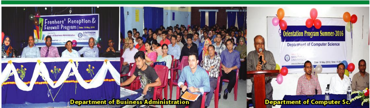
Department of Business Administration