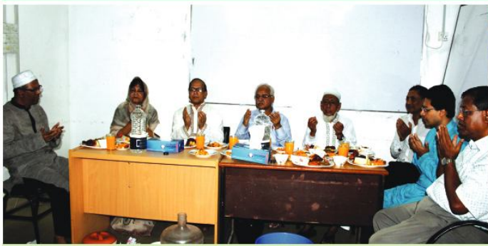
Department of Civil Engineering