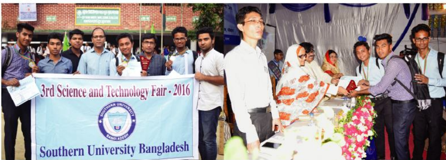
Southern University attends the 3rd Divisional Science and Technology Fair-2016 and achieve special award